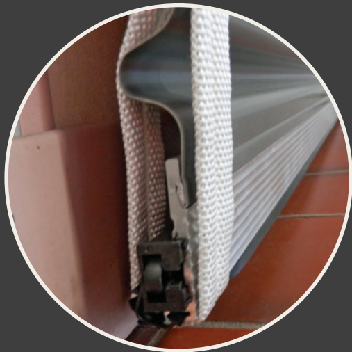
Deep profile adds to the NovaTaur ® curtain strength and rigidity