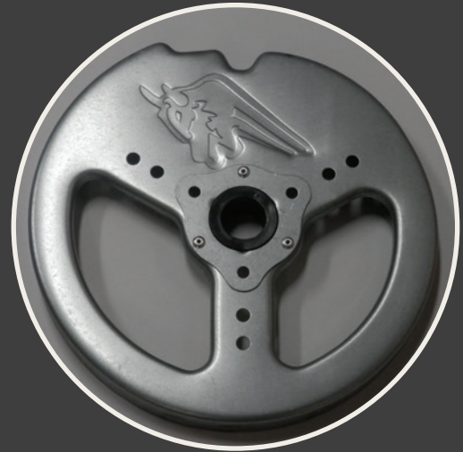
Specially designed drum wheel with plastic hub ensures smooth operation

Our leading-edge NovaTaur® commercial roller doors are ideal for your shopfront, warehouse or storage facility and will enhance the value and security of your business.