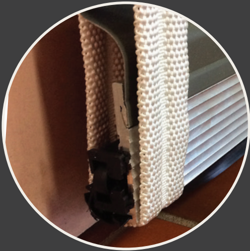
Heavy-duty bottom rail with wheel